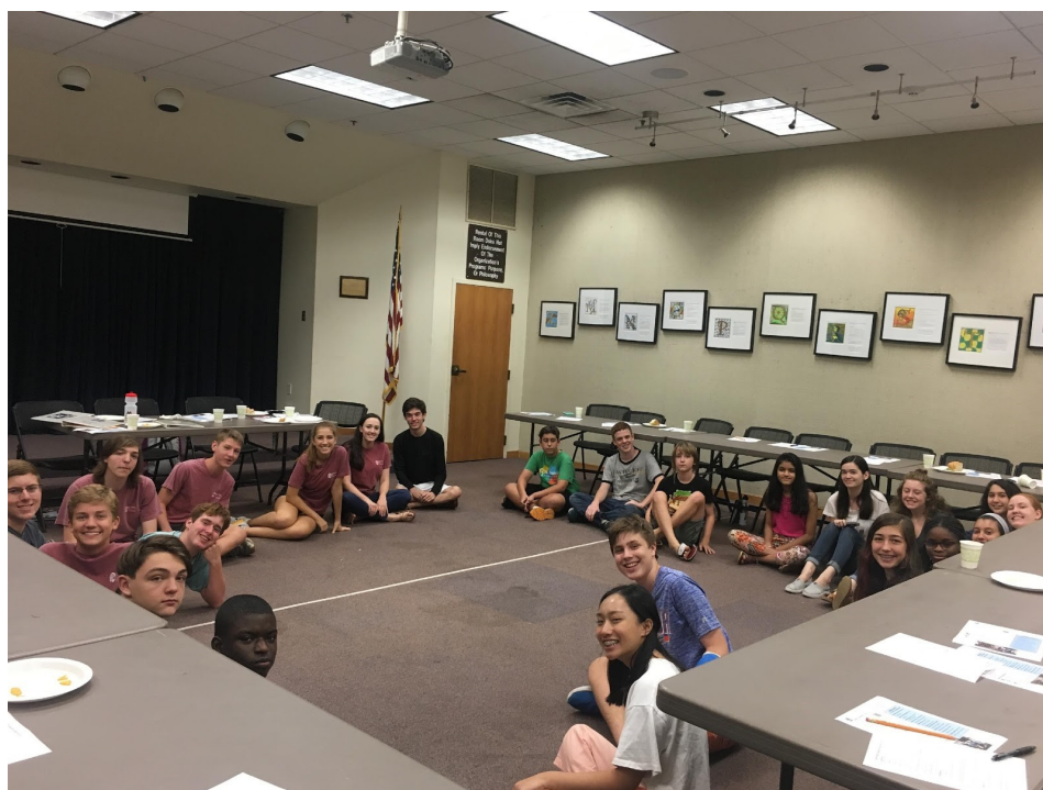
TAB members play the Question Ball at their first meeting.